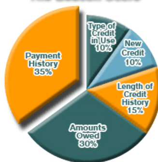
The Beacon Score

Payment history - Indicates whether you have made your credit card payments, loan payments and other payments on time